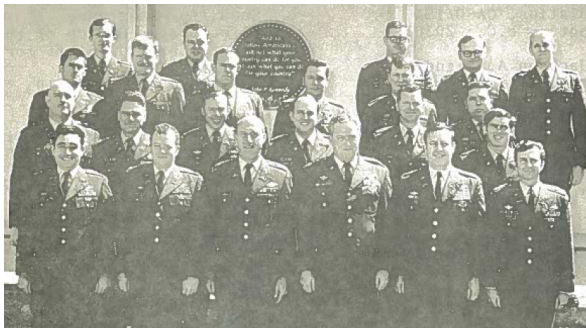
FAO Course 2-75 Graduation Class at the Eighth International Affairs Symposium featuring Dr. Hans Morgenthau. Two workshop topics included Combating International Terrorism and Peacekeeping and U.S. Operations & Policy.