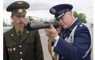
A Krygz Army Col. and U.S. military Attaché (USAF Lt Col) testing one of the Russian special purpose silenced assault rifles, AS "Val" delivered to the Krygystan's special forces at the Kant Base, Russia's first new military base on foreign soil since the collapse of the Soviet Union, near the Kyrgyz capital, Bishkek.

"Since the Marshall Plan days, we have truly been an international philanthropist. As a nation we have provided $125 billion in economic assistance worldwide, and supplied life-saving nutrition for over 1.8 billion people, equaling to 656 billion pounds of food to over 100 countries. We have also provided $79 billion in direct developmental assistance programs to help others help themselves." 6