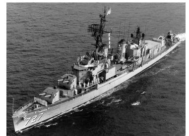
USS De Haven (DD-727), an Allen M. Sumner-class destroyer transferred to the Republic of Korea Navy in December 1973 renamed Incheon .

Nixon doctrine also led to Department of Defense headquarters reorganization that established the Defense Security Assistance Agency (DSAA) in September 1971. USA, Europe (designated Executive Agent) took over from the Air Force the responsibility for administrative and logistical support of military assistance advisory groups and missions in the Middle East, Africa,