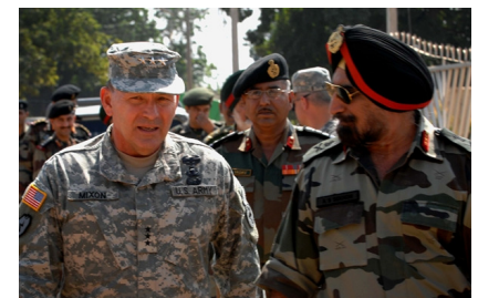
Army LTG Benjamin Mixon, commander of U.S. Army Forces in Pacific Command (PACOM), talks with the director of general military operations for India before a demo put on by the two nations' militaries at Camp Bundela, India, Oct. 26, 2009.

FAO Policy (DoDD 1315.17) was further revised on April 28, 2005, adding Title 10, Section 163, leveraging authority for the Combatant Commands (COCOMs), stating, "The COCOMs shall have the requisite war fighting capabilities to achieve success on the non-linear battlefields of the future." In February 2005, the Defense Language Transformation Roadmap was published and an additional DoD Instruction 1315.20 was signed on September 28, 2007. This instruction provided further guidance for the management of DoD FOA programs to include the establishment of a standardized format to be used by the military services, DoD components, and COCOMs for the Annual Report on DoD FAO Programs. The instruction also identified the Deputy Under Secretary of Defense for Plans within the Under Secretary of Defense for Personnel and Readiness as the principal staff advisor to the SECDEF for DoD FAO Programs.