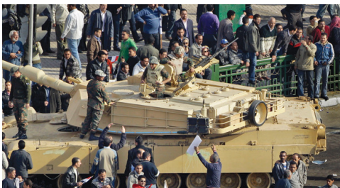
Egyptian Army tank in the middle of protestors. FMS have long been an instrument of U.S. diplomacy. By the end of 1981, Egyptian sales had reached $1.4 billion, managed by Security Cooperation Officers (SCOs).

Because of the decrease in the level of large-scale demonstration connected with civil disorder, U.S. active military forces were not deployed during FY72. However, with a possible disturbance connected with the Governor's Conference in San Juan, Puerto Rico, a Marine regiment was placed on alert and a liaison (LNO) representative of the Army Chief of Staff and DA LNO were sent to coordinate with local officials. While the conference was held without conflict, this was the first instance of detailed planning to deploy forces in a civil disturbance outside the continental U.S. In comparison, prior to 1972, the UN had deployed ten security and observation peacekeeping missions; three that are still active today in Jerusalem, Cyprus, and India and Pakistan, in addition to over forty (40) other missions established after 1972 to include high threat/conflict countries like Yemen, Somalia, and Afghanistan.