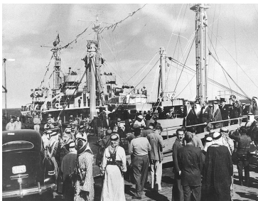
King Ibn Saud, of Saudi Arabia, leaving the USS Cimarron after a visit on board, probably near Dhahran, Saudi Arabia, circa 1947. Following the King are Mohamed Effendi (interpreter), J. MacPherson (General Manager, Arabian-American Oil Company), unidentified Saudi, J. Rives Childs (U.S. Minister to Saudi Arabia), and Colonel William McNowen (Military Attaché-U.S. Embassy, Cairo, Egypt).

By 1945, the U.S./Allied victory from World War II and Nazi war tribunals had begun, the Charter of the United Nations (UN) was established, and reformation/creation of the Arabian American Oil Company paved the way of making Saudi Arabia known for having the world’s largest reserves of oil. The U.S. had military attaches in 45 capitals (38 of which had air attaches and 28, naval attaches). In parallel, the United States Army (USA) had developed the Language and Area Training Program to provide officers with high level staff potential with knowledge of language and areas to form sound intelligence estimates and to provide command decisions. The program required four years of training; language school, graduate degree from a civilian university, and two years overseas in, or near, the region of specialization. 2