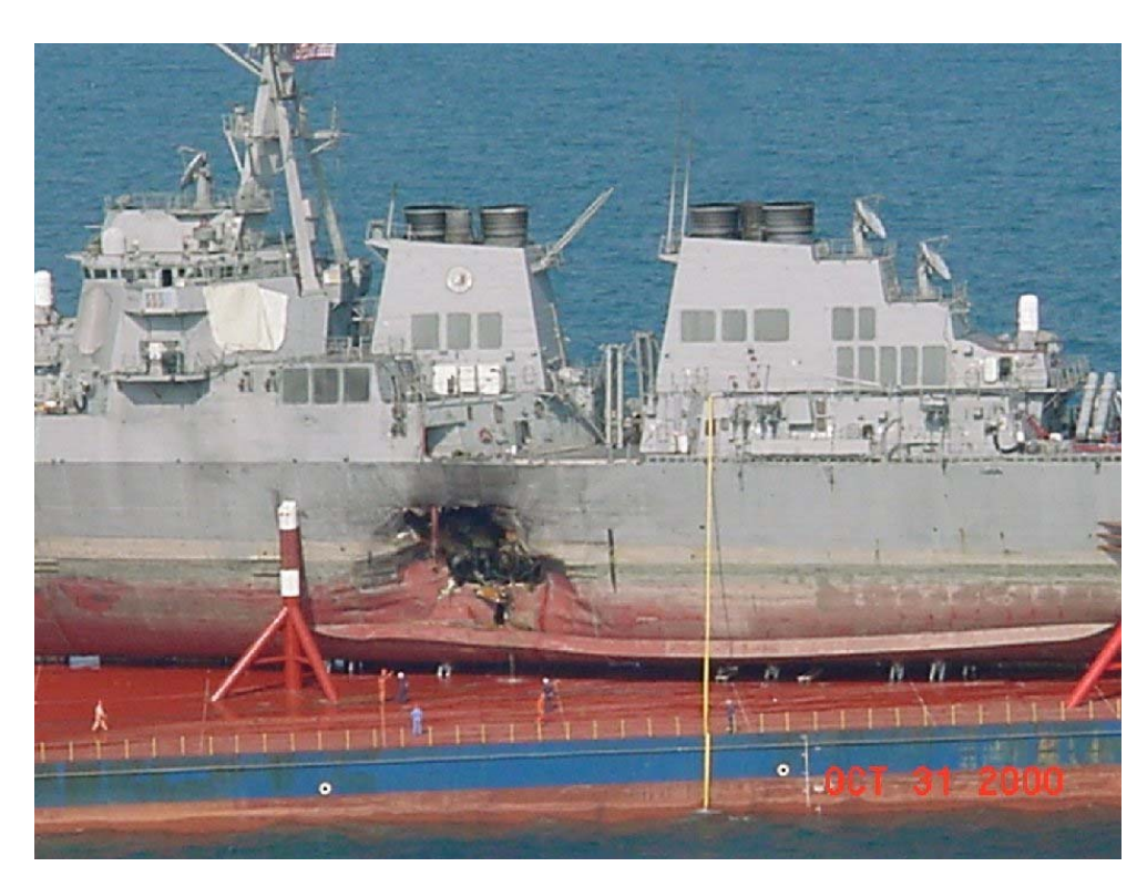
USS COLE 12 October 2000 Force Protection Matters